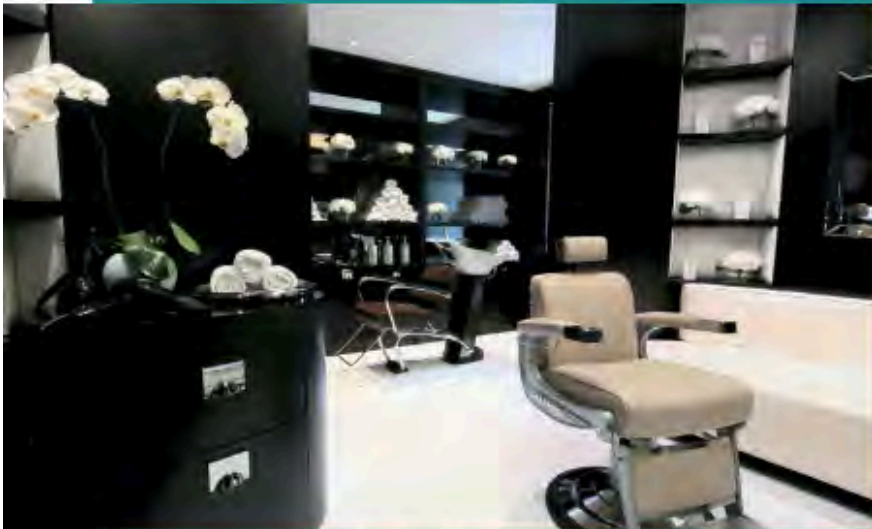
Celebrities and regular folks alike can now enjoy the high-end pampering suite just in time for the busy 2013 party season.