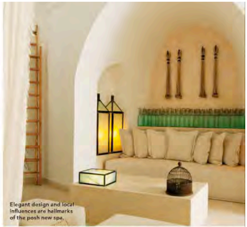
Elegant design and local influences are hallmarks of the posh new spa.

two-level, 19,000-square-foot retreat, the name of which means “true” in the local dialect. Treatments are performed using natural products and oils culled from the sea and nearby olive and citrus groves that are produced by small family-run businesses in the region and throughout Southern Italy, as well as the Italian cosmetic brand BAKEL for skincare. The spa, designed by Pino Brescia, features 14 treatment rooms, a spa suite with a private garden and steam room, a social suite for nailcare, a floatation room, an infusion bar, a heated indoor pool, a full-service hair salon and barbershop, a fitness facility complete with Technogym equipment, a yoga and Pilates studio, a café, and a bookshop. Additionally, the spa features a Roman bath-style wet area with a tepidarium, a caldarium, and a frigidarium along with two scrub rooms and a basil-infused sauna. It’s la dolce vita at its finest.— Julie Keller Callaghan